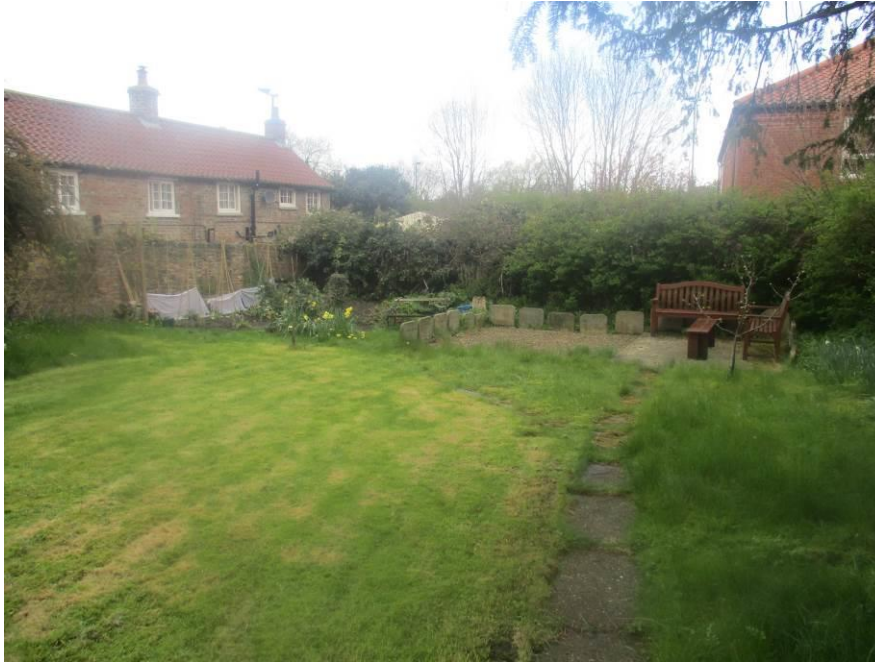
Figure 3: Burial ground

Royal Botanical Gardens in Kew as a Keeper of the Herbarium. Baker became a Fellow of the Royal Society and the Linnaean Society.