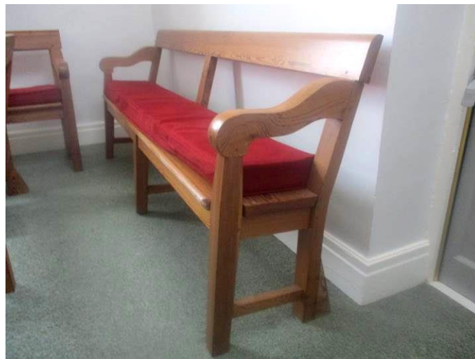
Figure 2: One of the open-backed benches in the meeting house

The meeting house contains a set of benches with open backs and shaped arms, which date from the nineteenth century.