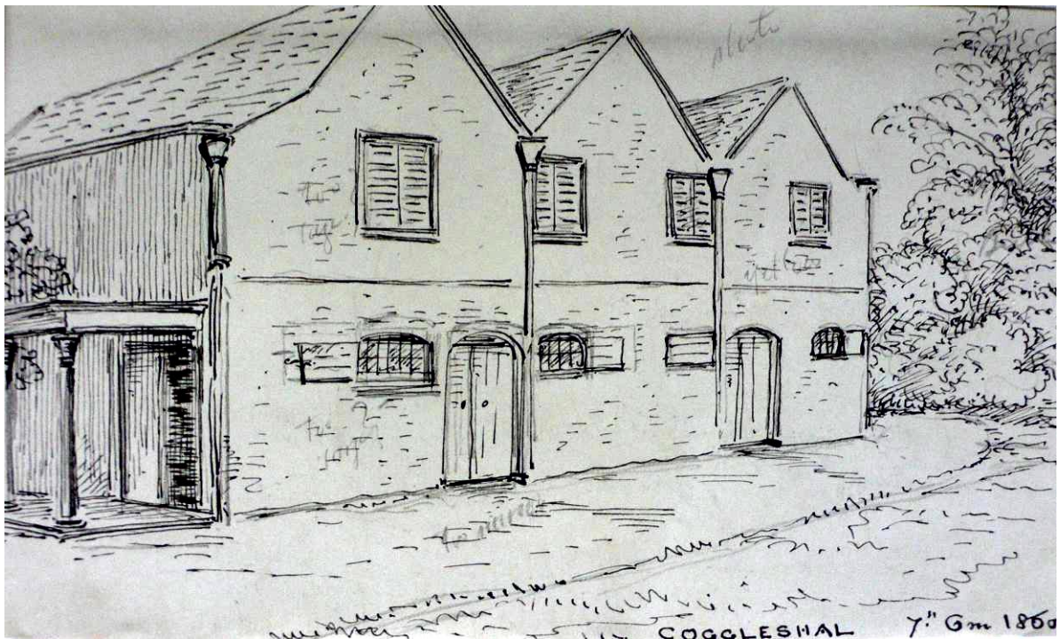
Figure 1: The early eighteenth-century meeting house, drawing of 1860

The burial ground to the west was extended in 1783 but went out of use in 1856. It now forms part of the land belonging to a modern housing development. Two headstones of 1855 remain close to the eastern boundary wall, for which drawings and transcriptions exist in the County Historic Environment Record (SMR no.8734).