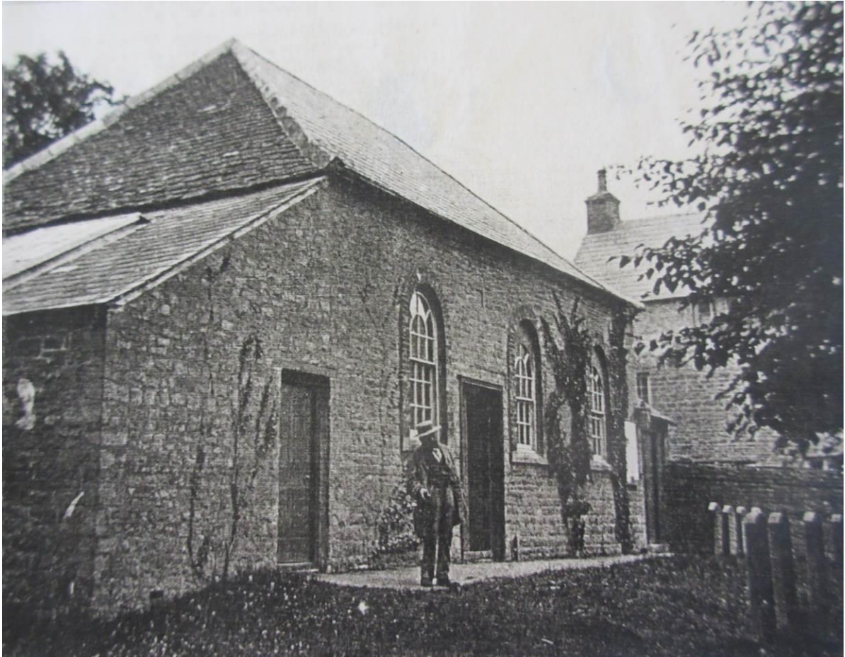
Figure 2: Undated photograph showing the alterations of c.1860

The meeting was discontinued in 1957, and the building was let as an office to J. Alan Bristow, architect. It returned to Quaker use in 1987, when internal alterations included the removal of the elders' stand and the return of the original or previous benches, tables and bookcases. In 1990-1 a new extension was built on the north side, replacing that of c.1860, from designs by Robert Franklin of Oxford; it was named the Arthur Bissell Room, after the principal donor. This provides a new entrance lobby, kitchen and WCs and a small meeting room. The c.1860 door on the west elevation was removed, but the datestone remains above, along with a cast iron boot scraper to the side of the blocked opening.