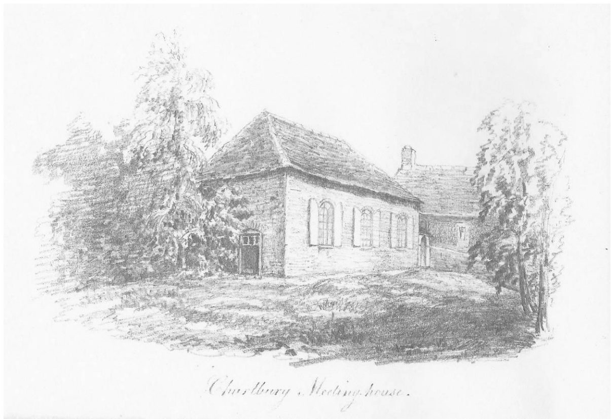
Figure 1: The meeting house in c.1800 (Charlbury Local Meeting)

A small meeting house was built on the present site in Market Street in 1681, on land given by Thomas Gilkes of Sibford. This was replaced by the present building and burial ground in 1779, 'the stones and mortar of the old building being used in the new' (PM 1779, quoted in Butler, p. 497). The cost was £191 1s 2d. The original external appearance, with the entrance on the return on the north elevation, is shown on a drawing of c.1800 (figure 1), and a conjectural plan by Butler is shown at figure 3.