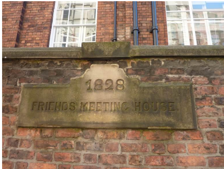
Figure 5. Stone panel in the precinct wall

The front boundary wall is ashlar surmounted by replacement steel railings to Mount Street; these walls return along the sides of the forecourt, with stone piers. From this point they continue around the site in brick laid in Flemish bond with stone copings. On the south side the wall incorporates a stone panel with the date 1828.