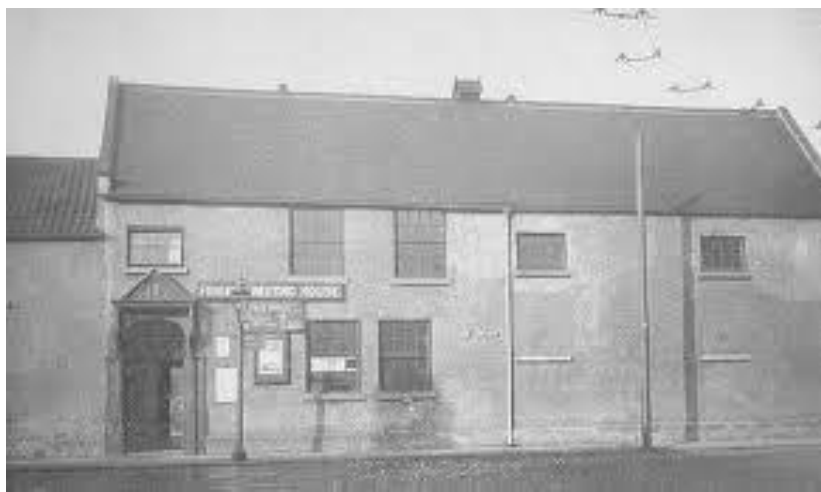
Fig.1: The meeting house on West Laith Gate before demolition in the 1970s (Balby meeting)