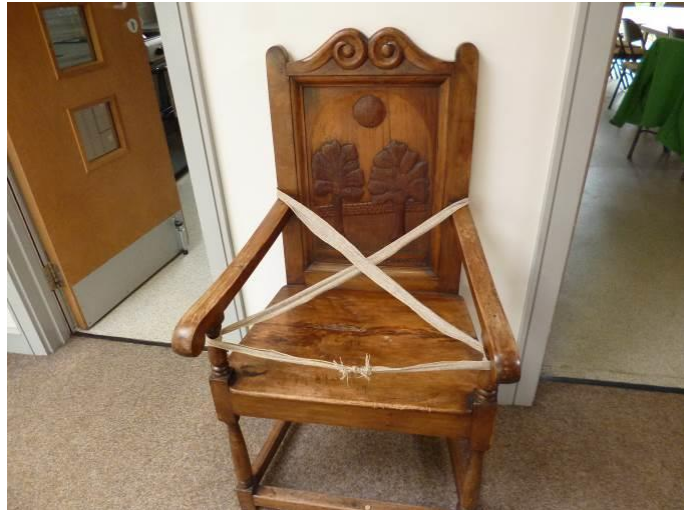
Fig.3: walnut chair made in c.1931, commemorating George Fox's last visit to Balby in 1669