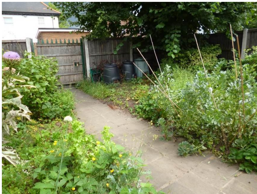
Fig.4: path laid with re-set grave stones in the garden

The meeting house is located in the centre of a housing estate in Balby Bridge, on the south-west edge of Doncaster town centre. The estate contains three point blocks and a mix of deck-access maisonettes and 2-storey housing built in the 1970s. Several other faith groups have premises nearby including the Salvation Army, the Methodists, an evangelical church and a mosque. Most of the residents rely on benefits and the meeting provides an important community resource in this deprived area. The meeting house has an open landscaped frontage with lawns and a group of birch trees which partly screen the attached dwelling (tenanted). Behind the meeting house is a small enclosed garden, with flowers and vegetables; the path is laid with grave stones West Laith Gate burial ground, including some to members of the Clark family. The Quakers have plots H25- H35 in a section of Rose Hill Cemetery (Doncaster Council), and burials from West Laith Gate were reinterred in