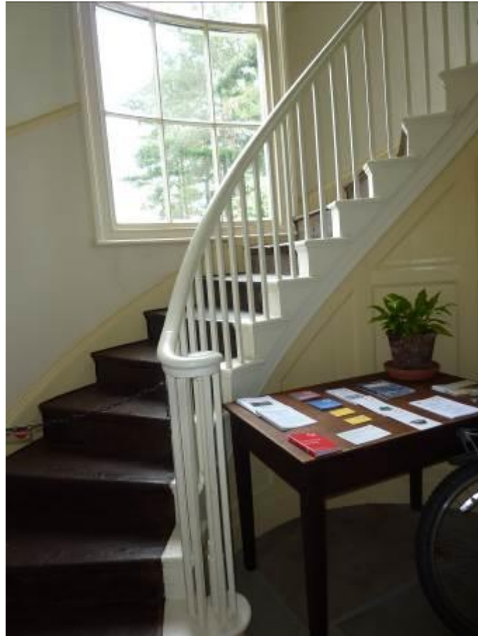
Figure 2. The stair and the curved stair window