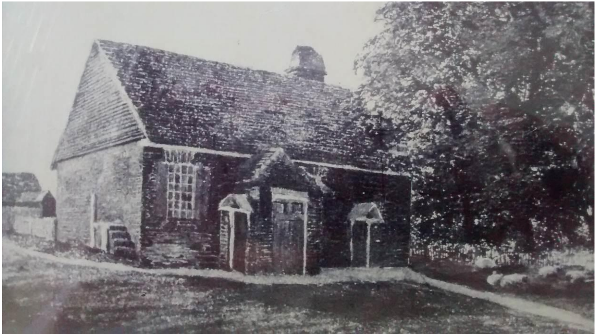
Figure 1: Undated painting of the first meeting house built in 1688 (Local Meeting archive)

It was built to a design by the architects Barber, Bundy & Partners who also built 20 sheltered flats for the elderly on the site (known as Thomas Moore House, built for the Reigate Quaker Housing Association). Part of the new building was erected over the basement of the 1889 classrooms.