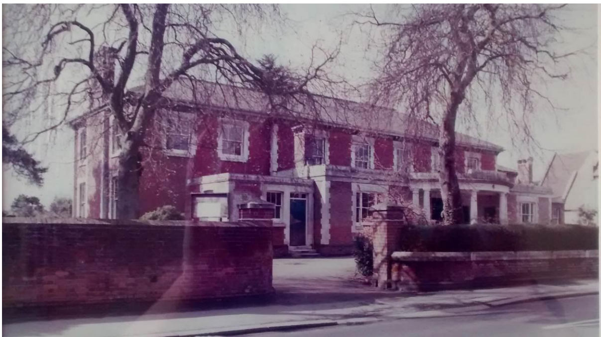
Figure 2: Undated photo of the second meeting house built in 1857