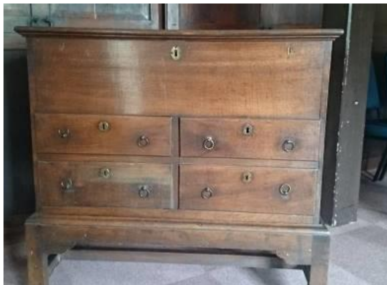
Figure 3: Cabinet in reception area dated 1794.

The reception area contains an oak document cabinet (Fig.3) with a large single top drawer and two pairs of drawers below with brass fittings. The cabinet contains a message: “this box was made by John Rullson of April in the year 1794 for the soul use of the Monthly Meeting of Great Strickland to preserve securely all the deed writings and other papers belonging to the said meeting and paid for at the public expense.”