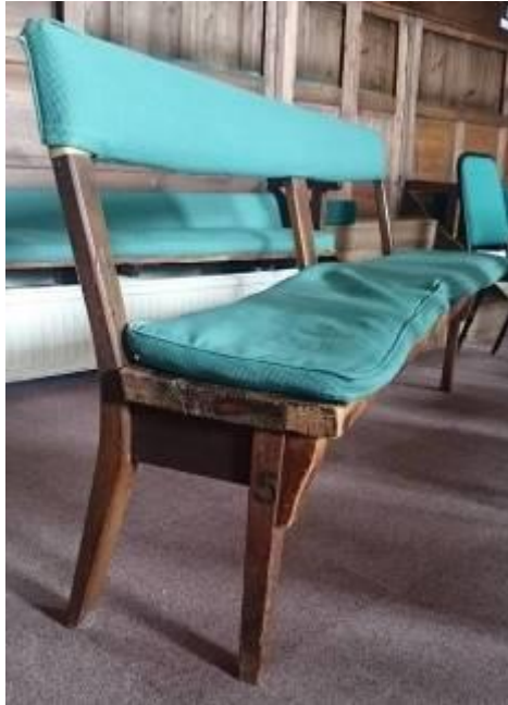
Figure 2: Historic pine bench

The seating consists of a mixture of historic benches and modern loose chairs arranged in a circle around a central table. The main meeting room contains historic pine benches (Fig.2) possibly dating from 1803 or earlier, with later upholstery.