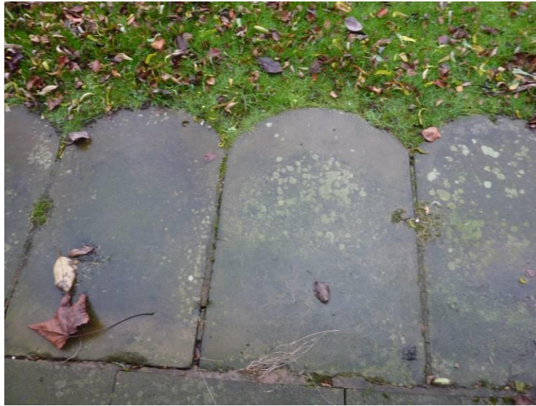
Figure 3. Headstones in the garden