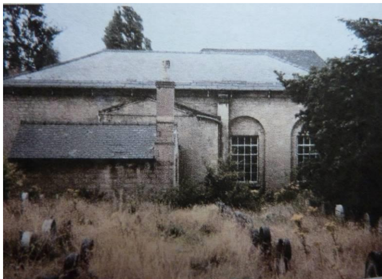
Figure 1. The previous meeting house of 1800