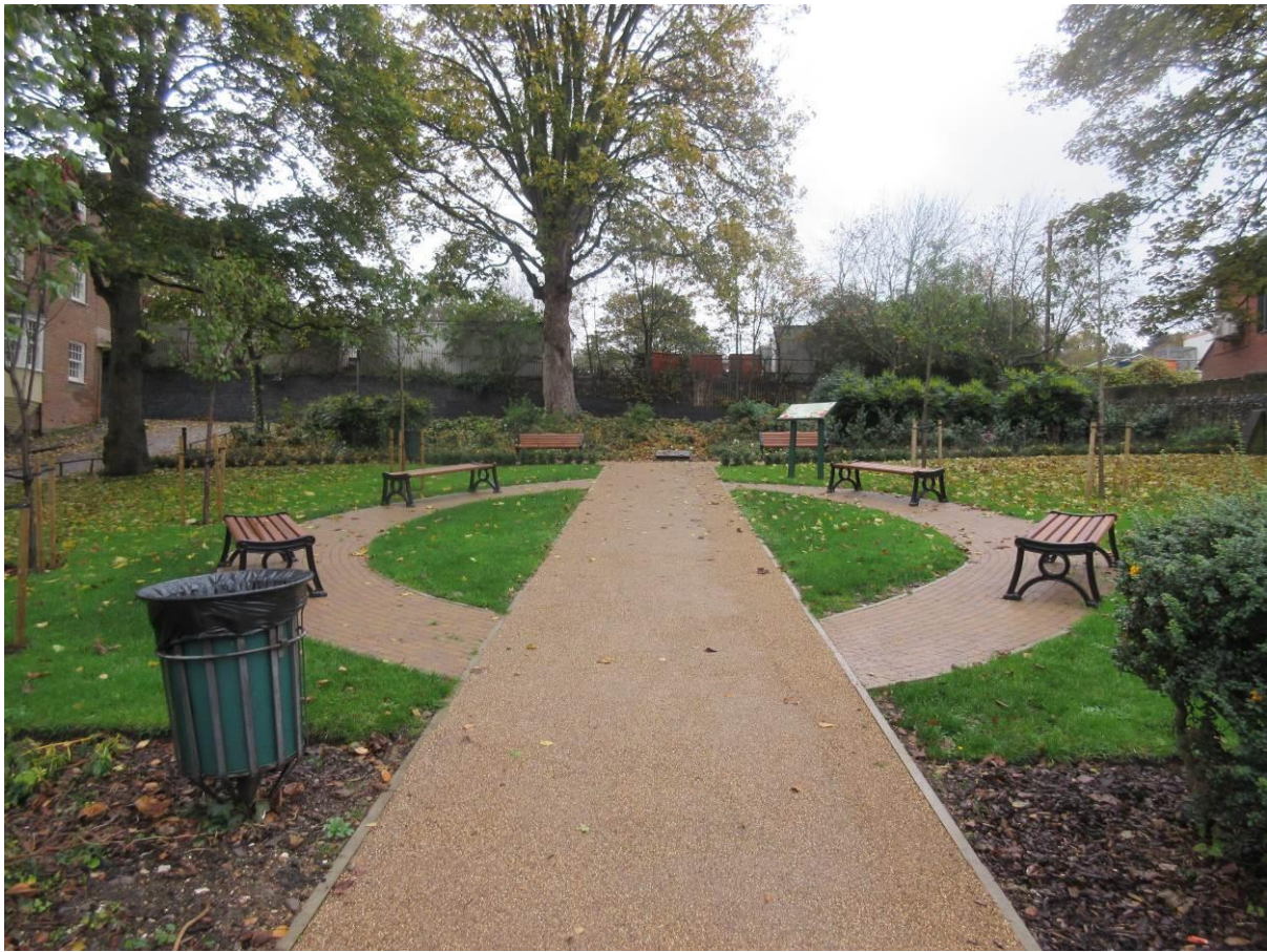
Figure 2: The former burial ground, now Peace Garden