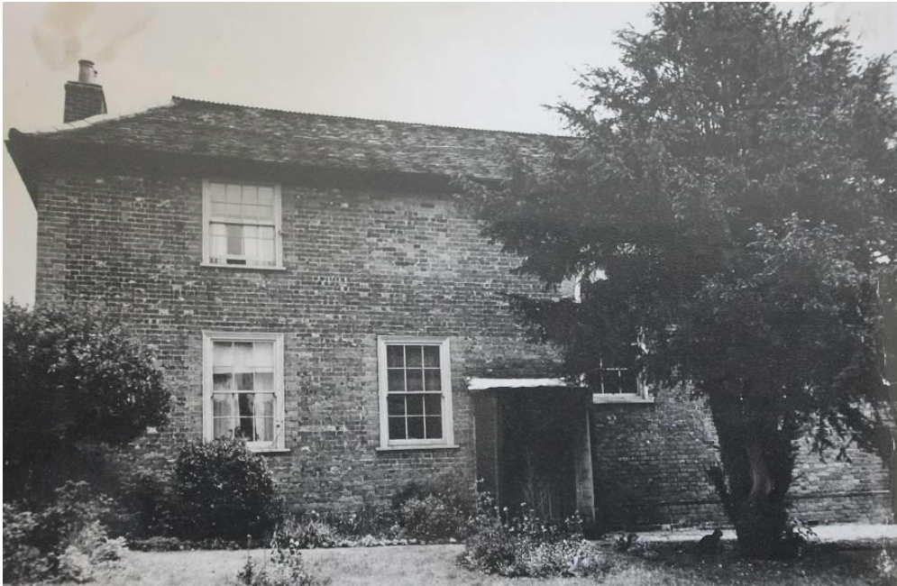
Fig.1 The west front of the meeting in 1949

The date of the first meeting in Hemel Hempstead is not known, though a place was registered in 1699. In 1718 Quakers purchased a plot of land as a site for a meeting house and burial ground and a new meeting house was built in that year, largely superseding an existing meeting house 2 miles away at Wood End. A dwelling was built onto the north end of the meeting house in 1808 and the old building was re-fronted to match the new addition. The fortunes of the meeting had declined by the end of the nineteenth century and no regular gatherings were held between 1905 and 1948.