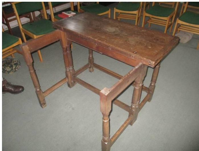
Figure 3: Replica table

In Adderbury, an oak table used by George Fox at the opening ceremony in 1675 was donated by Bray Doyley. The table was kept at Adderbury until the Second World War when it was relocated to a local Quaker's house for safe keeping; it is now at Swarthmoor Hall. According to Wood (1991), in the late eighteenth century South Newington's meeting house was built, modelled on Adderbury and a replica table was made which stayed with the meeting until its closure in 1910, subsequently relocated to Banbury. The replica table is in the smaller meeting room, now used for worship (Fig.3).