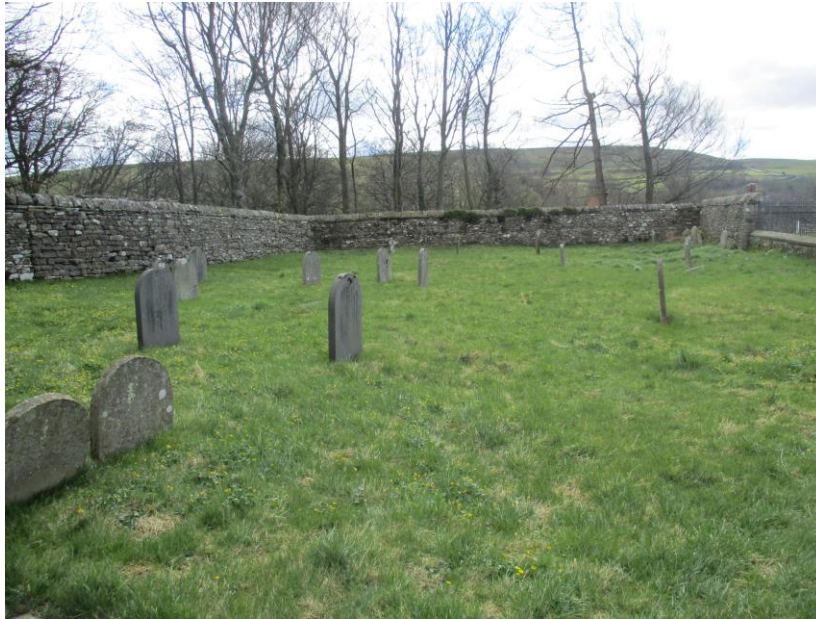
Figure 4: Attached burial ground