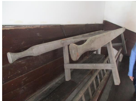
Figure 3: Bier