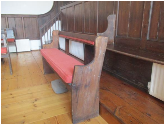
Figure 2: Open-backed bench with solid bench ends.

The meeting house contains pine benches of open-backed bench design with solid bench ends. Stored in the gallery is a bier.