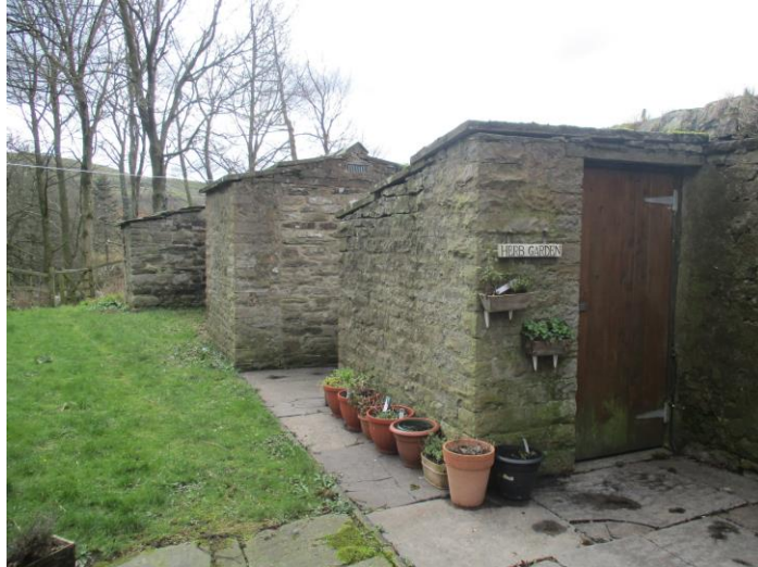
Figure 5: Outbuildings