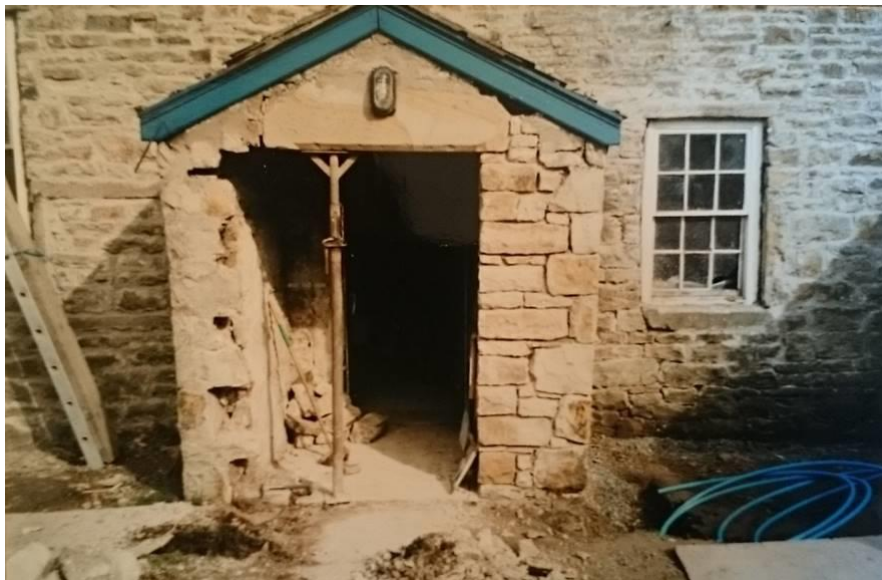
Figure 1: External repair works 1996/1997

Friends in Alston began to meet again in 1972 as a result of new Friends moving into the area. In 1996 the building was refurbished with external repairs (Fig.1) and new toilet and kitchen facilities added in the former women's meeting room. The work was managed by Peter Kempsey of Countryside Consultants.