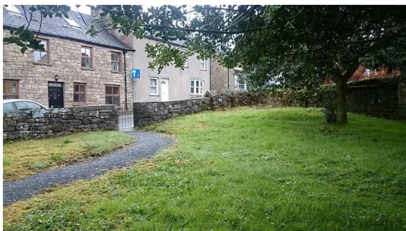
Figure 4: Burial ground (from the north)

The burial ground is located to the south side of the meeting house, enclosed by a dry stone front wall with simple metal gate from the street. The Alston burial ground expresses simplicity and contains no headstones. The Alston Meeting burial registers identify sixteen burials which include a number of early Quakers from the Pickering family. The earliest known burial was of John Pickering in 1805 and the last in 1874.