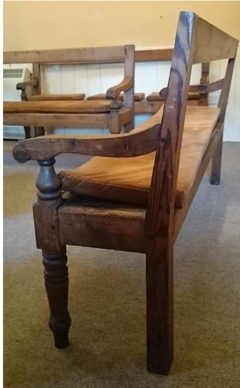
Figure 3: Meeting room benches

No historical information about the benches is available (Fig.3). The turned front legs of the benches match the design of the fixed bench to the minister's stand, which suggests they date from 1859.